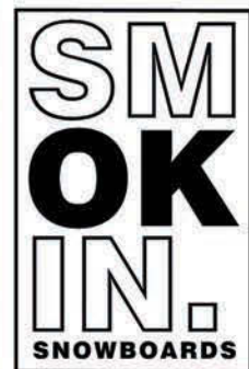
POW WOW SPLIT